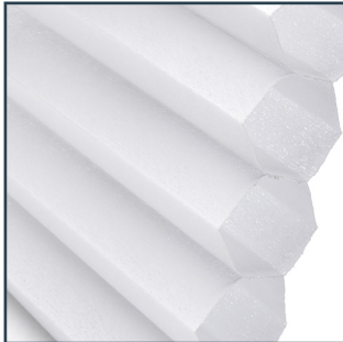
White 3000mm ○ 25mm