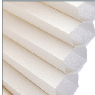
Pearl 3000mm ○ 25mm