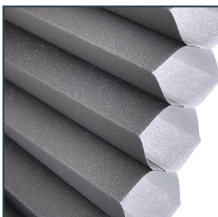
Shadow 3000mm ○ 25mm