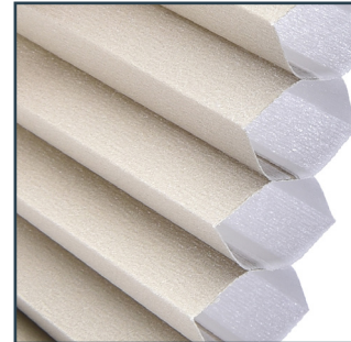
Pelican 3000mm ○ 25mm