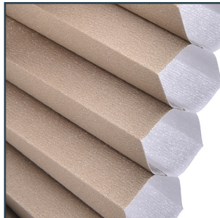
Soft Taupe 3000mm ○ 25mm