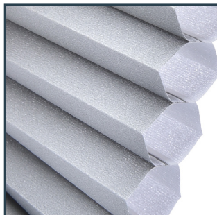
Alloy 3000mm ○ 25mm