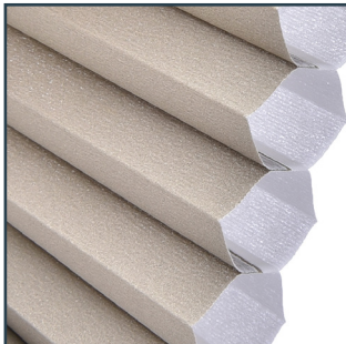
Silver Mink 3000mm ○ 25mm