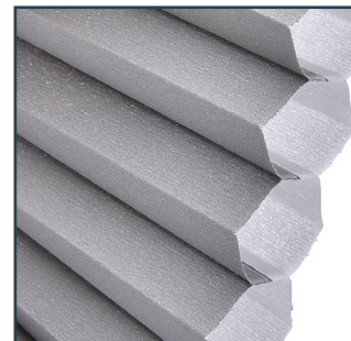
Lava Grey 3000mm ○ 25mm