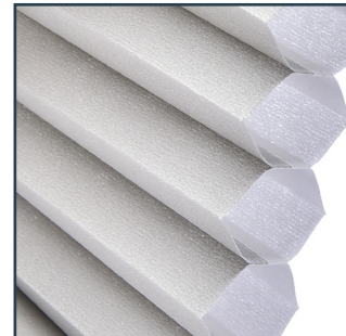
Flint Grey 3000mm ○ 25mm